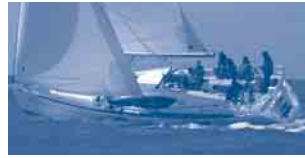
Sun Odyssey 45 DS