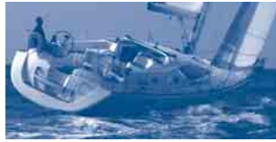
Sun Odyssey 42 DS