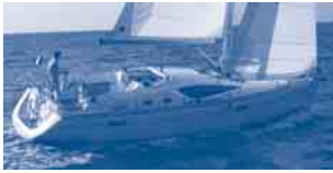
Sun Odyssey 39 DS