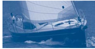
Sun Odyssey 50 DS