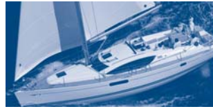
Sun Odyssey 45 DS Performance