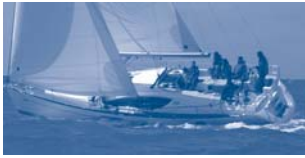
Sun Odyssey 45 DS